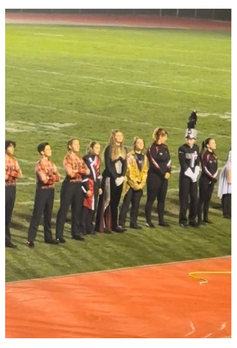
Marching Band at Troy Competition