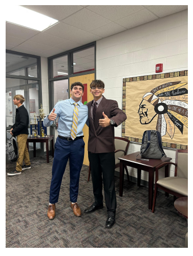
Senior Homecoming Court Photos