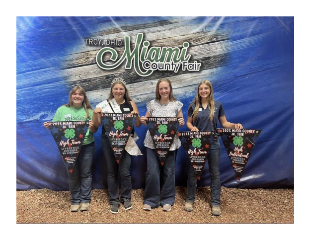
Miami County Fair Livestock Judging