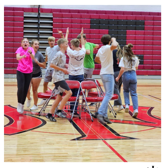
Musical Chairs at the FFA meeting 116