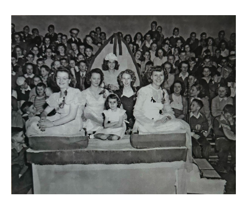
The first ever Newton Homecoming 1947