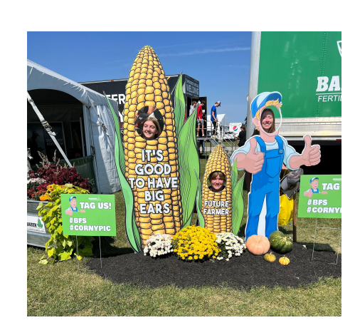
Farm Science Review