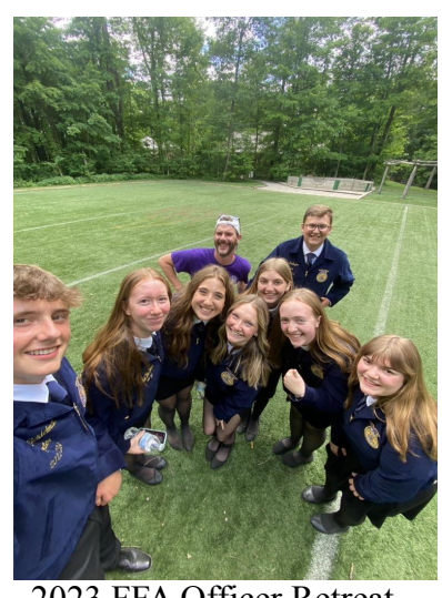
2023 FFA Officer Retreat