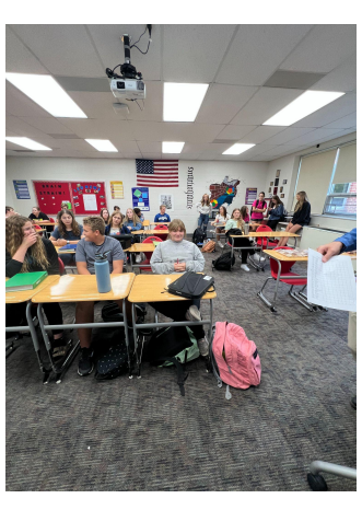
First Leo Club Meeting of the School Year.