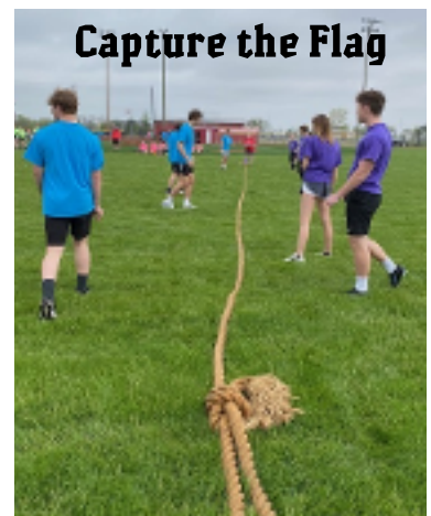
Capture the Flag

Lunchtime consisted of hot dogs, chips, desserts and eating outside with friends. Students were spread out participating in many events but seemed to gather around for the Kickball game and Dizzy Lizzy. Everyone watched Tug-of-War and could be heard cheering loudly!